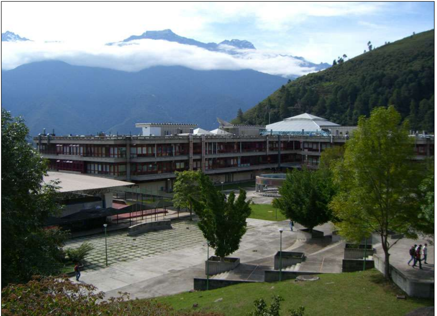
The campus of the ULA, located at the start of the Andes at 1600m above sea level. The pico Bolivar can be seen at the left (with snow), is the highest mountain in Venezuela (5000m)