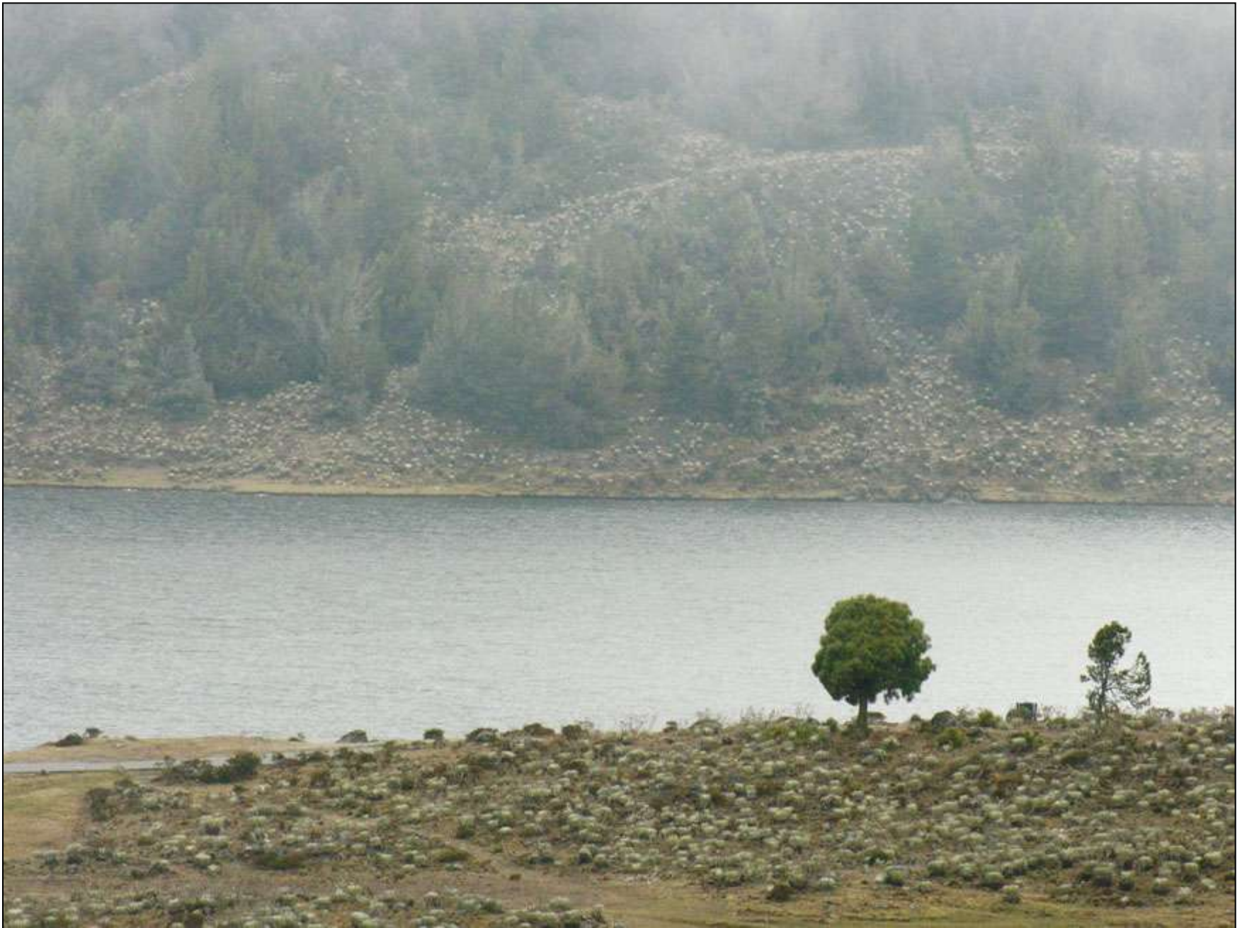
The Frailejón all over the páramo mountains