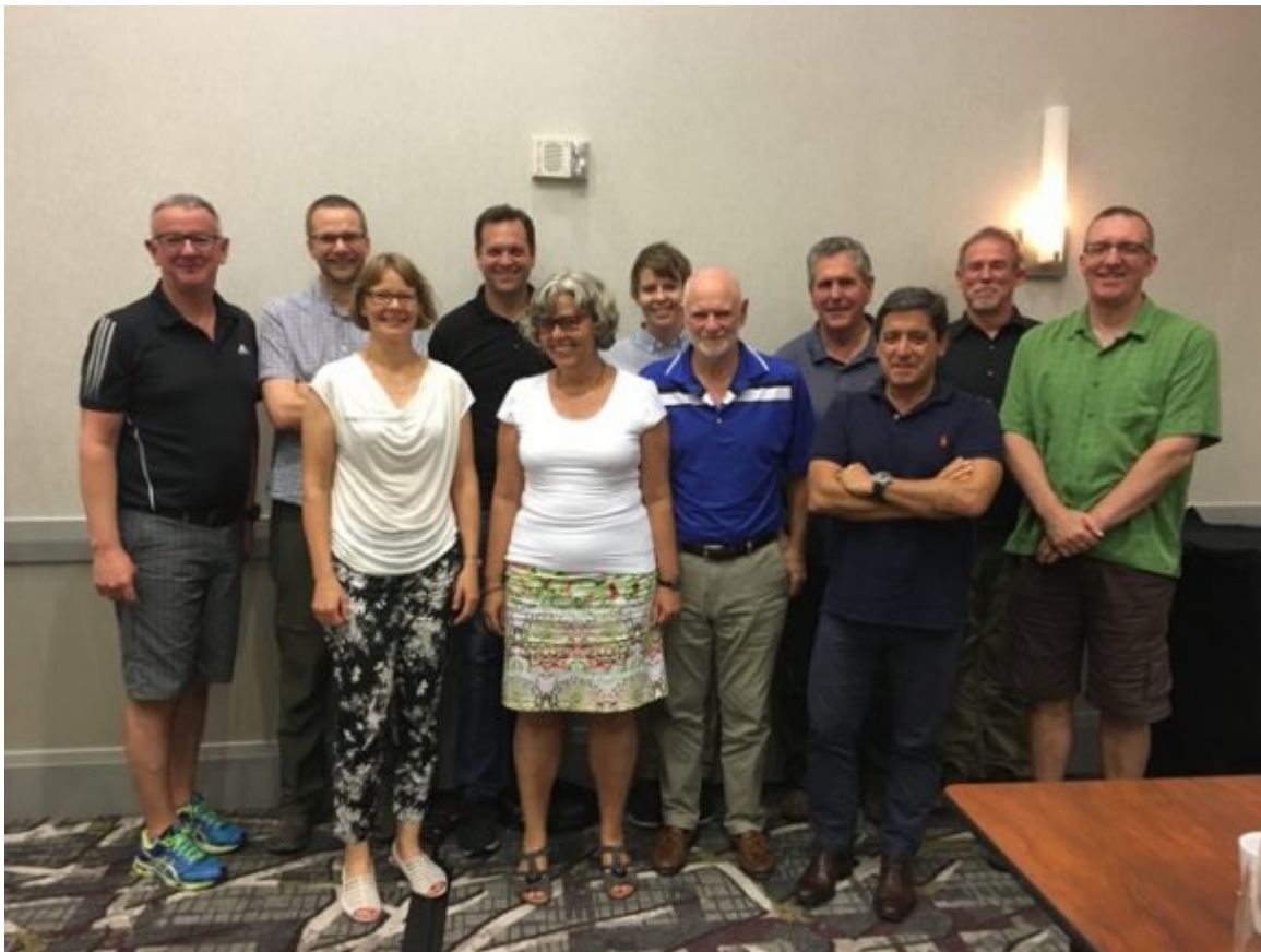
ISB Executive Council in Raleigh

In August, the ISB council convened in Raleigh, North Carolina, for their annual meeting. The council meeting was held over two days, prior to the American Society of Biomechanics Conference in the same city. It was pleasing to see so many council members attend the meeting, as council members travel to all of our meetings at their own cost.